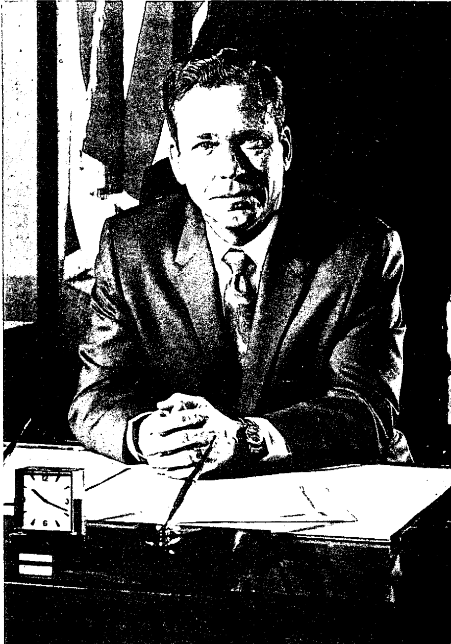
WARREN E. HEARNES